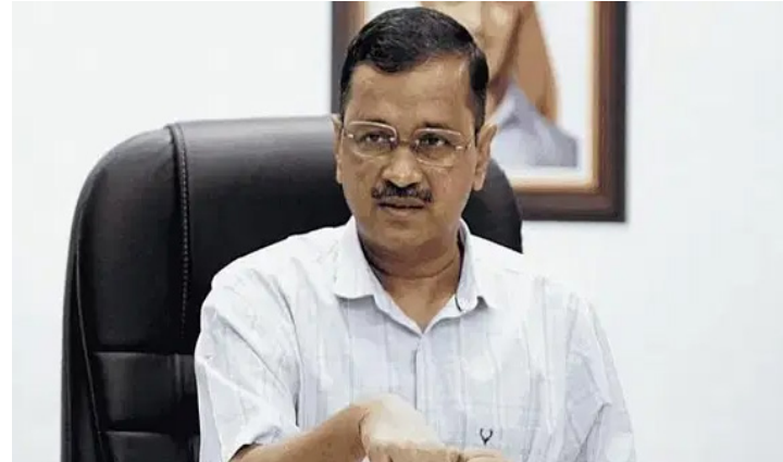
In 2018, the Supreme Court banned diesel and petrol vehicles

The government will deploy 530 water sprinklers to prevent dust pollution and 385 teams will check vehicles' pollution certificates and prevent the plying of overage cars.