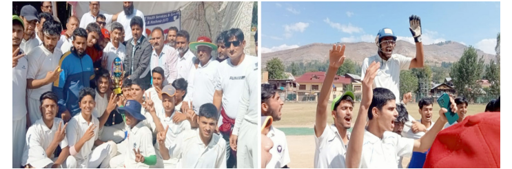
outstanding win and remarkable achievements on the cricket field. This victory not only adds another accolade to Baramulla's rich sports history but also underscores the immense talent and dedication of our young cricket stars, he added.