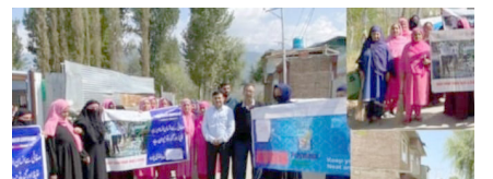
drives is to impart sense of hygiene among the people which strengthens the central concept of ongoing Swachhta Hi Seva campaign. The DPO further said that in connection with ongoing Poshan Maah programme and Swachhta Pakhwada, the officials ICDS in Bandipora visited the slum area to create awareness regarding hygiene and nutrition related issues.