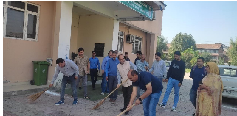
among the officers/ officials of the department is to ensure a hygienic environment around for their overall Director Agriculture actively took part in the cleanliness drive together with other participants carrying brooms to exemplify their commitment to cleanliness with an objective to disseminate message regarding the event.