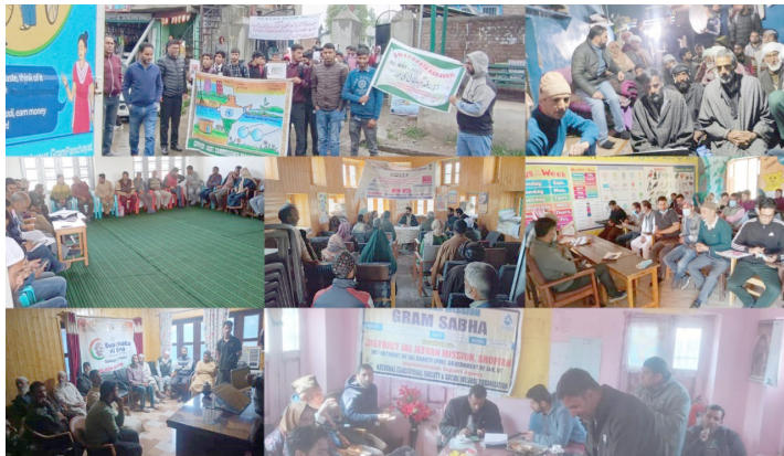
the achievements under SBMG-II. It was informed that the District has already achieved ODF plus model status under which all

SHOPIAN, SEPTEMBER 29: Under the ongoing Swachhta Hi Seva campaign, Department of Rural Development is celebrating the ODF plus model camps in all the blocks of district Shopian along with engaging people taking the solemn resolve to sustain the mission. The camps were mainly held at Block headquarters of Chitragam, Zainapora, Shopian, Kanjiullar, Ramnagri, Kaprin, Keller, Imamsahab and Hermain. The camps were attended by a large number of public and were chaired by BDOs of the concerned blocks. Members of different strata of society were made aware about